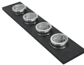
4 Spices-holder set