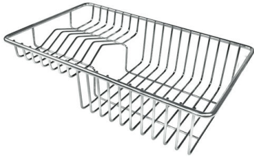
Stainless steel plate rack