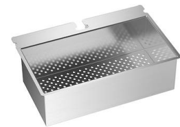
Stainless steel colander

* only in combination with the accessory 8100 621