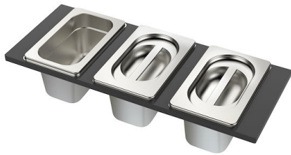
3 Bowls set