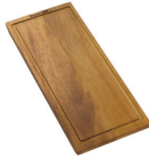
Walnut-wood chopping board

* only in combination with the accessory 8644 101